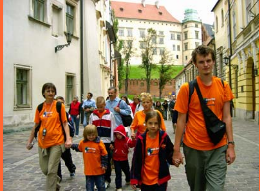
Walk on the streets of Krakow