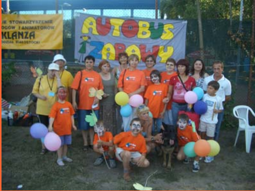
Fun Bus - Autobus Zabawy