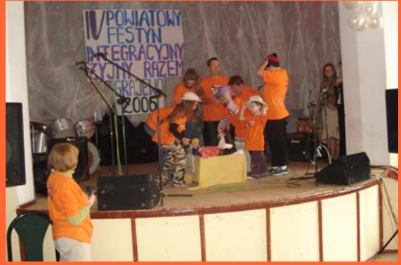
Appearance at the festival in Grajewo