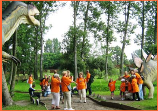
Among the dinosaurs .