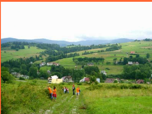
Climb to the top Maciejowa