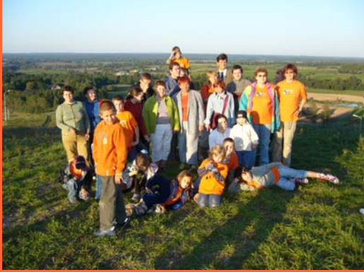
At the top-panorama at Suwalki