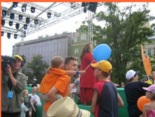
Enchanted song, Krakow