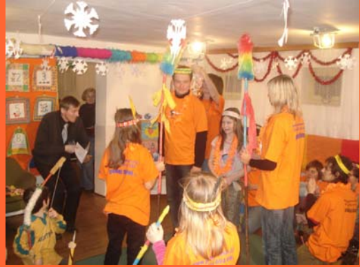
The Indians living at the premises of the association test