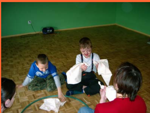
As the birds-the first attempt.