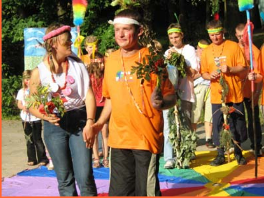
Life of Indian-performance, Smerzyn