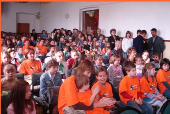
Festival in Grajewo.