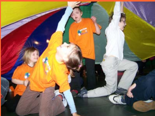
Play therapy with scarf